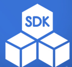
Audio Advertising SDK